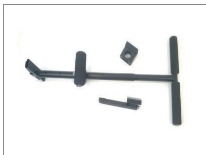
Push and drag bar