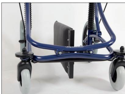
Leg separation plate