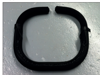
Front cover, with divisible zip, for trunk support Ø70/90