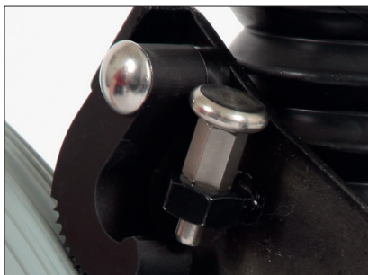
Non-reverse brakes set