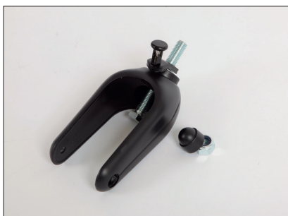
Front swivel locks set