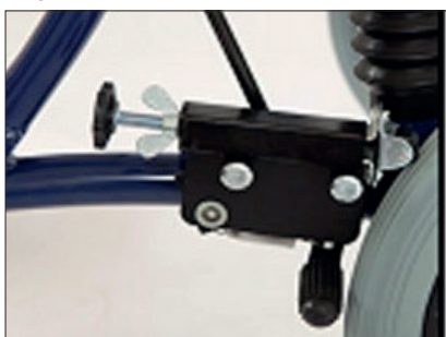
Drag brakes set